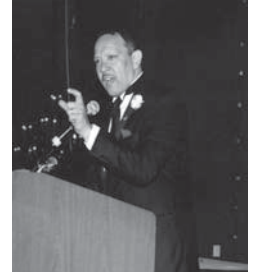
Marc Morial, NUL President

Certainly the highlight of this past fall was our Gala. We were delighted to have Marc Morial, the President of the National Urban League, as our keynote speaker. Byron Brown, Buffalo’s new Mayor, was also in attendance with his family.