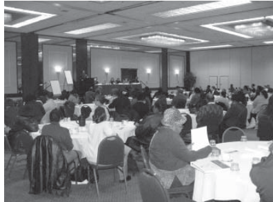
Buffalo Urban League's Minority Housing Fair at the Hyatt Hotel

One day, the P family was visited by a door-to-door salesman from a window company to do home improvements. This predatory salesperson got the family shackled with a frightfully high home equity loan. After our staff intervened, the loan officers of the bank finally listened and understood the household's predicament. We made sure that this family didn't remain hopelessly trapped in their financial circumstance.